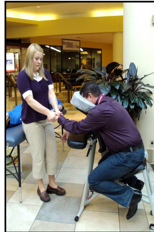
Health Fair attendees received chiropractic tips, free massage and flu shots.