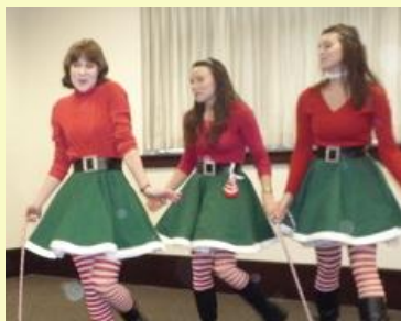
The Portland Sugarplum Elves spread holiday cheer at December's luncheon.

Board Meetings, open to all, are held the 3rd Thursday of the month at noon - 1:30pm at Calaroga Terrace